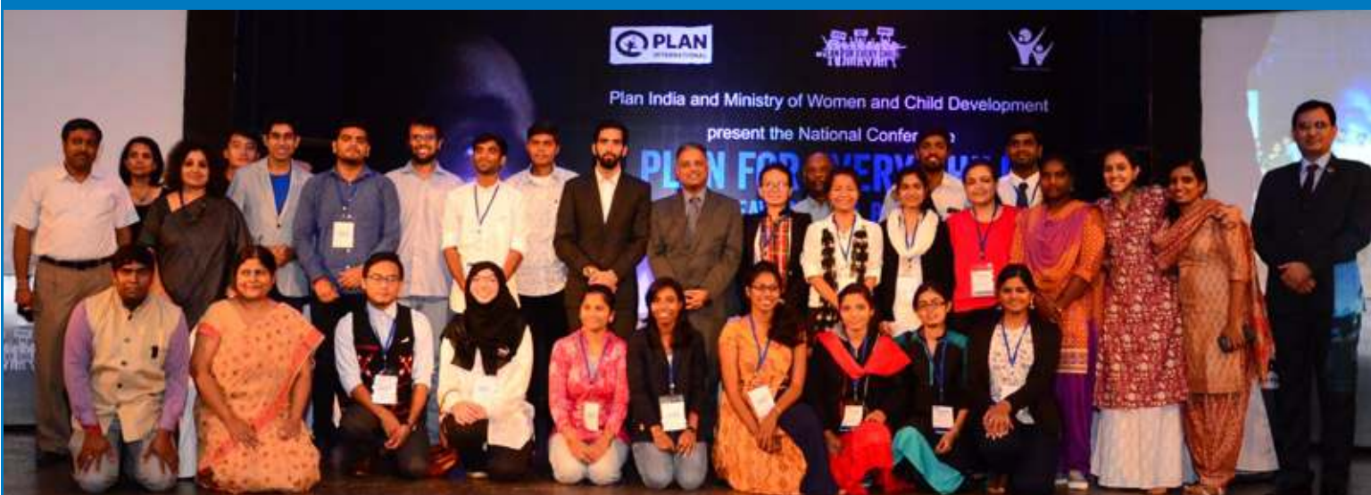
▶ Youth debaters from across the country at the Debatathon Final

India's rapid development, economic growth and associated urbanisation has resulted in the continuous movement of people from rural to semi-urban areas and larger cities. There are no comprehensive or credible estimates of street children in India, with numbers ranging from 11 million to as high as 18 million. There are innumerable challenges faced by street-connected children, particularly girls connected with the street. The vulnerabilities of girls living on the street, street-working girls and girls from street families as well as solutions towards solving these issues were discussed in this session.