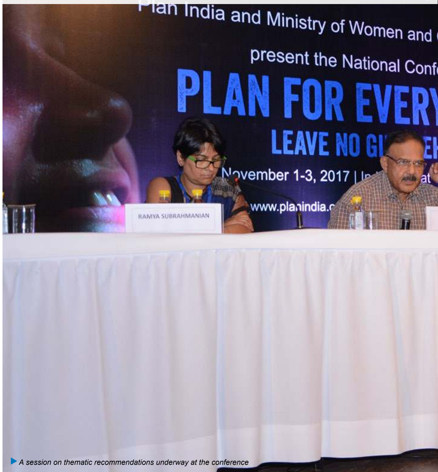
▶ A session on thematic recommendations underway at the conference