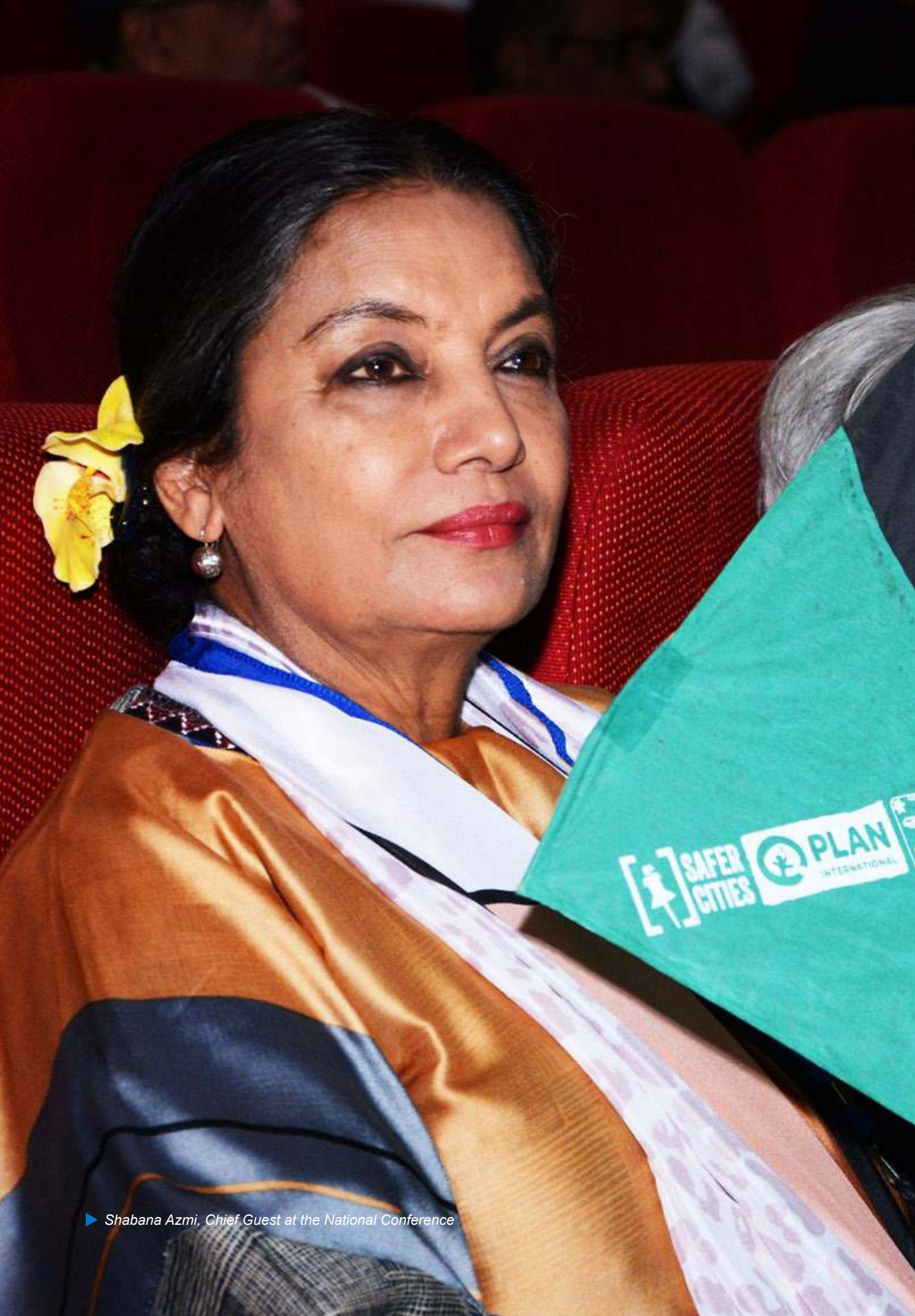
▶ Shabana Azmi, Chief Guest at the National Conference