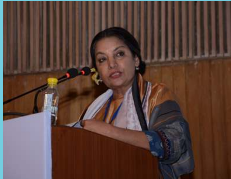
► Shabana Azmi addressing the audience on Day 1

Ms. Azmi recognised the efforts made by the Government of India over the years through its policies, laws and programmes to ensure children's rights for their survival, development, protection and participation. She flagged the stranglehold of patriarchy as the key factor marginalising children and discriminating between a boy and girl even before the child is born. Gender-based discrimination and inequality between the sexes are omnipresent in every field and it