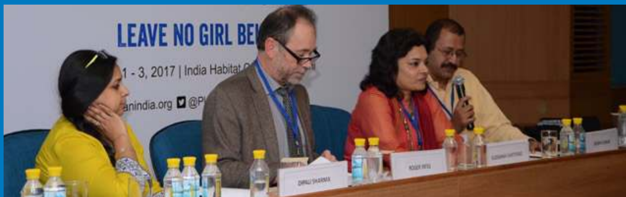
▶ Natural disasters and climate change being discussed during the conference

Climate change is a global challenge that burdens everyone, though disproportionately. The environmental changes directly impact women and make them vulnerable because of socio-cultural factors such as generally being poorer and less educated as well as having a lower health status and limited direct access to or ownership of natural resources. Climate change-induced migrations have accentuated vulnerability of girls. The session on 'Girls in Natural Disaster and Climatic Change' analysed the issues faced by girls in recent disasters such as the Chennai floods of 2015. The speakers offered suggestions and recommendations in improving the situation for girls and making them more resilient against natural disasters and climate change.