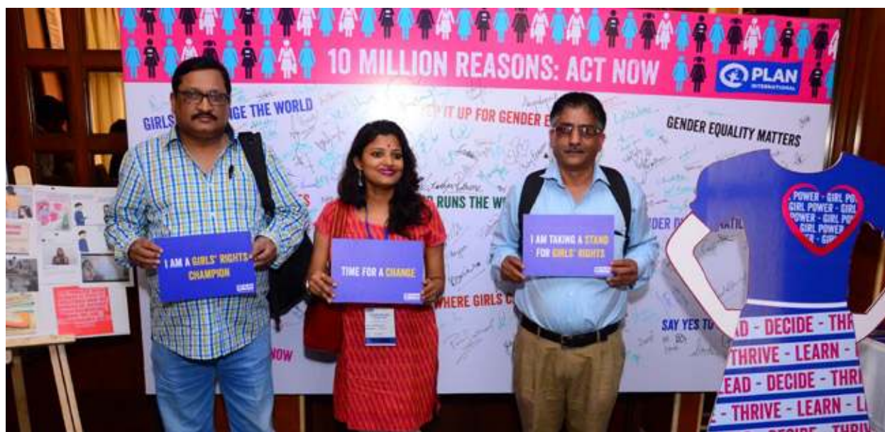
► Participants at the National Conference with messages on gender equality

The youth were prepared well for National Debatathon on the above-mentioned two themes while the winners of these two rounds had a final impromptu third round where the topic was decided by the jury. The best debaters were selected by eminent jury members. (See the main body of the Conference Report to know the views of the youths and outcomes of the National Debatathon.)