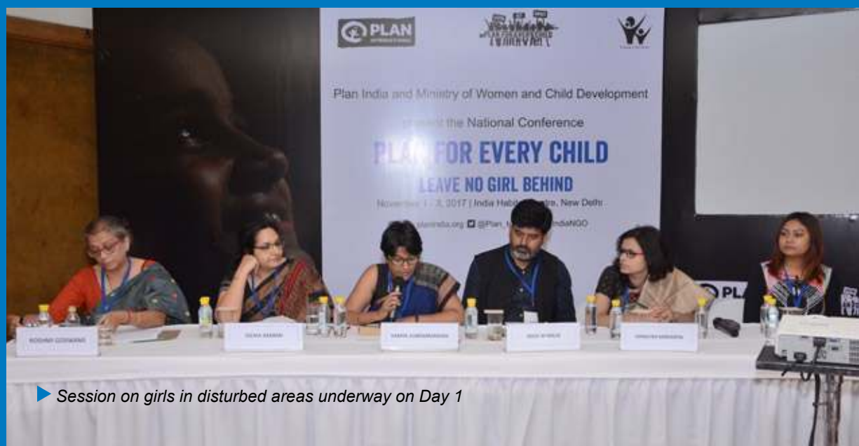
▶ Session on girls in disturbed areas underway on Day 1

The session deliberated on the situation and issues of girls in disturbed areas. Several studies indicate a correlation between Violence Against Women (VAW) and conflict. Situations of external violence, crisis and instability lead to various distinct forms of gender-based discrimination and violence against women and young girls, including stringent curbs on their already-limited freedom as well as sexual violence by all sides. The legal provisions for children along with the role of CSOs and the media in assisting children and women, especially young girls, in disturbed areas were analysed in this session.