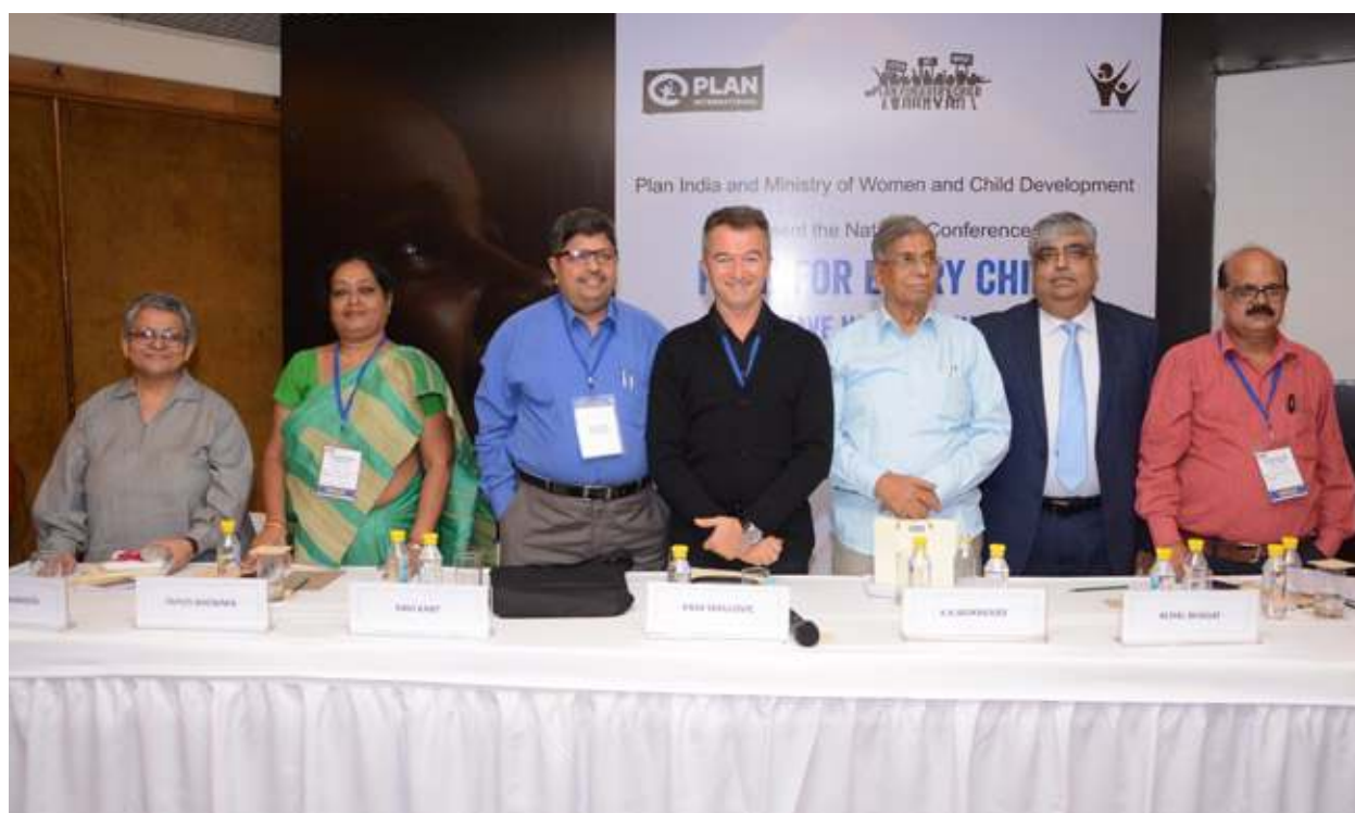
▶ Panellists at the conclusion of a session on girls and human trafficking

Trafficking in India is widespread and chronic, which includes cross-border and interstate trafficking. India has been defined as a source, destination and transit point for trafficking, indicating the robust demand from national and international syndicates. Given the entrenched systems existing within the nation, it provides safe passage for traffickers. There has been a constant increase in the number of cases from 2,599 in 2004 to 17,330 in 2014 (NCRB, 2014). The victims of trafficking generally hail from economically backward, poverty-stricken families. Accordingly, the session deliberated relevant issues pertaining to trafficking in India and sought to find viable solutions for preventing and protecting young girls from being trafficked while focusing on the rehabilitation and reintegration of victims.