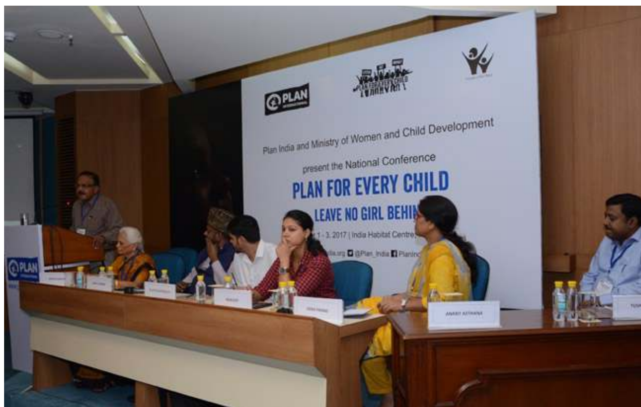
▶ Panellists discussing girls in care and protection homes

The session deliberated on the status of children, especially girls staying in shelter homes. Children in need of care and protection and those in conflict with the law are housed in homes run by the Central and state governments and NGOs. The Juvenile Justice (JJ) Act of 1986 was amended in 2015 and came into force in January 2016. A report prepared by Asian Centre for Human Rights (ACHR) found cases of systematic and often-repeated sexual assault on children in juvenile justice homes. The reports state that out of the total 39 cases, 11 were reported from government-run juvenile justice homes. Therefore, the session sought to focus on solutions addressing the issues of girls in these homes.